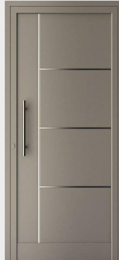
PU Painted Door

Natural wood finish with elegant grain patterns.