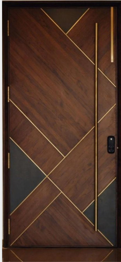
Engineered Wooden Door

Multi-layered construction for stability and warp resistance