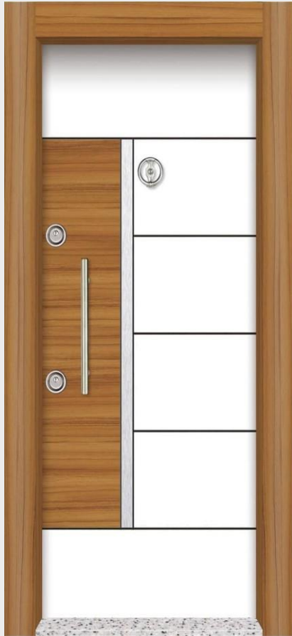
Membrane Wood Door

PVC-coated doors with smooth finish and moisture resistance.