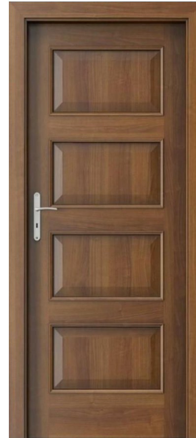
Solid Core Door

Lightweight yet strong, with chipboard tubes for structural integrity