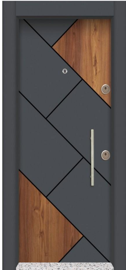
Tubular Core Door

Lightweight yet strong, with chipboard tubes for structural integrity