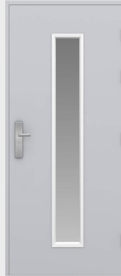
Vision Panel Door

Multi-layered construction for stability and warp resistance