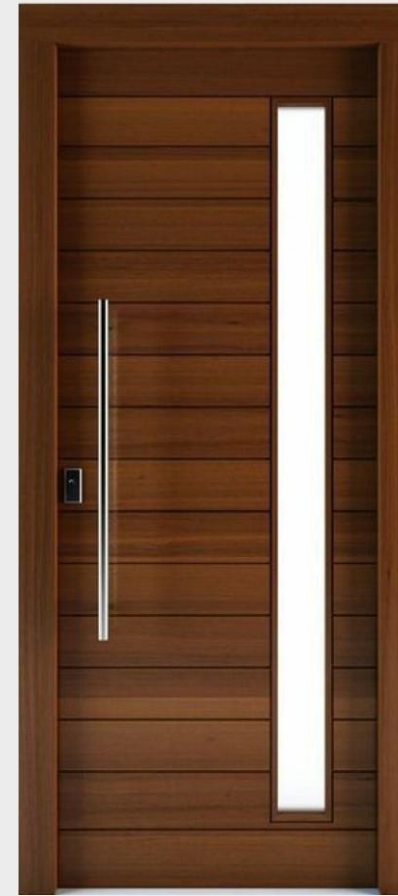
Solid Wood Door

PVC-coated doors with smooth finish and moisture resistance.